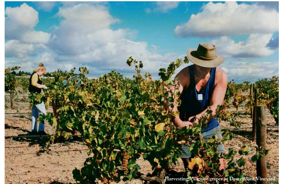
Harvesting Viognier grapes at Descendant Vineyard