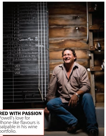
RED WITH PASSION Powell's love for Rhone-like flavours is palpable in his wine portfolio.